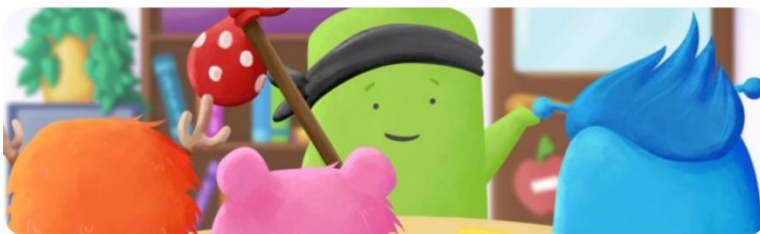
A Secret About the Brain

https://ideas.classdojo.com/i/growth-mindset-1