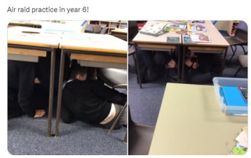
Air raid practice in year 6!