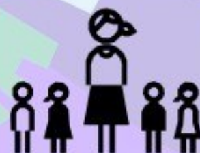
In Class Support