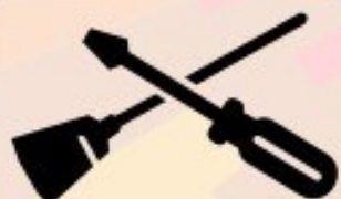
Maintenance & Odd Job Days