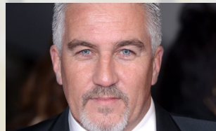
Paul Hollywood— Known for designing and creating many bread recipes.

Paul Hollywood is a well-known modern day chef who is famous for designing and creating many different bread recipes. There is a wide range of different breads available to us such as; white, wholemeal, wholegrain, pitta, French stick, olive bread.) Fruit and vegetables can be added to many different bread recipes to alter the taste and texture of the bread.